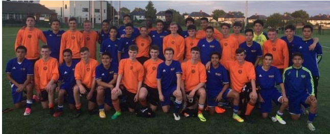
Hollister Tremors and our Under 17 DDSL Premier

We had a number of teams from America who arranged friendlies against us.