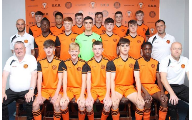
We were delighted to hear that St Kevins Boys were to be part of the inaugural FAI Under 15 SSE Airtricity League.

While the other teams involved had all known for months that they would be part of this initiative we had to wait until the teams were finally announced.